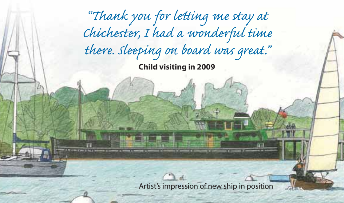
Artist's impression of new ship in position